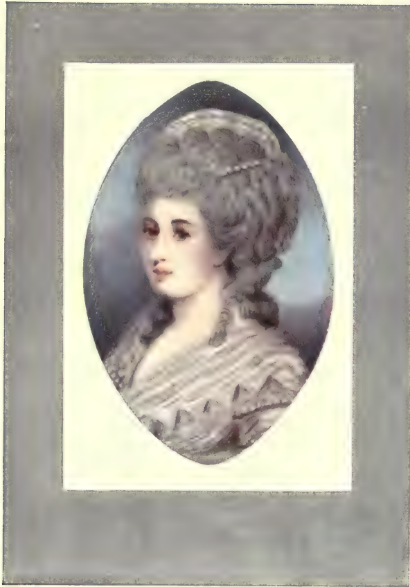
VISCOUNTESS ST. ASAPH ( NÉE LADY CHARLOTTE PERCY) SECOND WIFE OF GEORGE, VISCOUNT ST. ASAPH, AFTERWARDS THIRD EARL OF ASHBURNHAM BY RICHARD COSWAY, R.A.